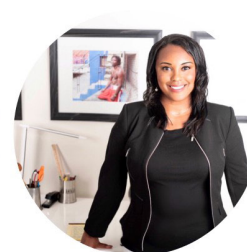
Dr. Angela Davis